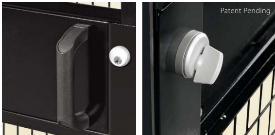
Standard doors include pull handle, built-in cylinder lock and thumbturn.